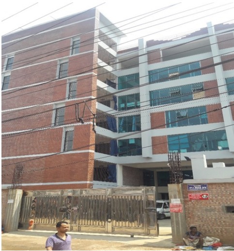
Front of Factory